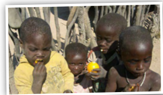
Our kids really enjoy oranges!